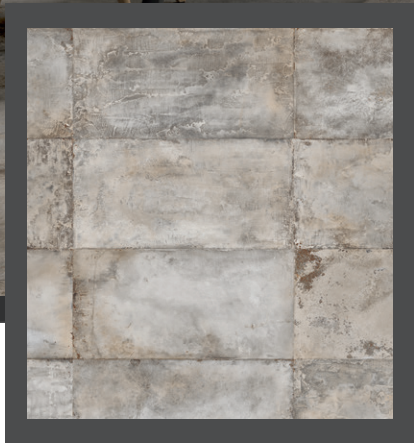
Stonecrete Sanded Cement