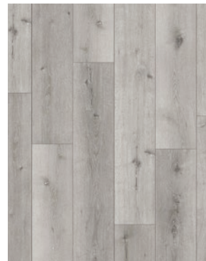
CONCORD - 7" X 60" ONLY