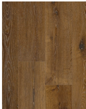
LEXINGTON - 7" X 60" ONLY