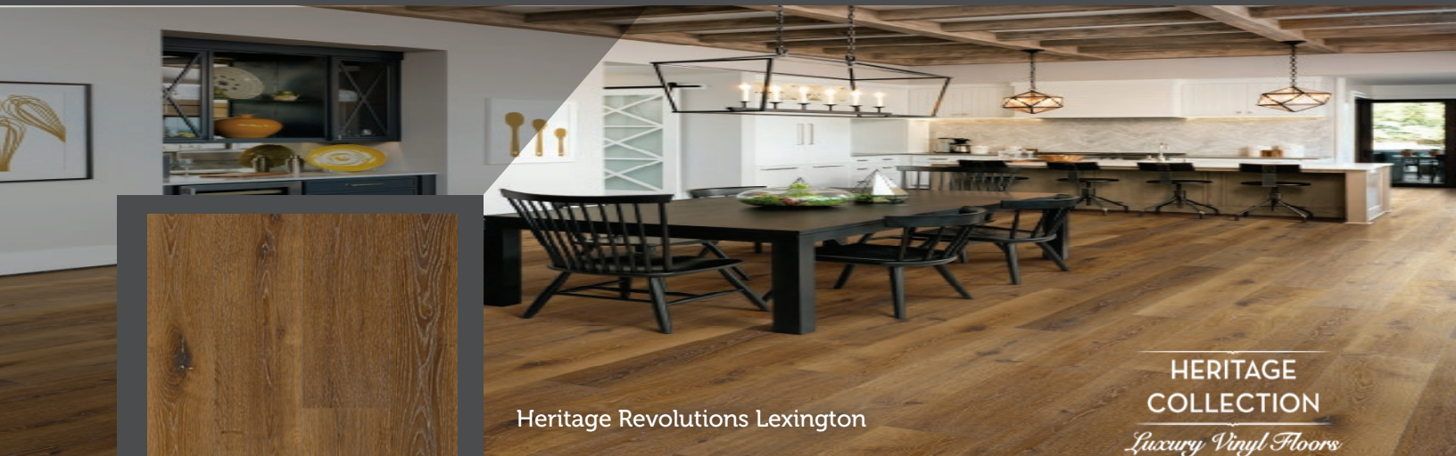
Heritage Revolutions Lexington