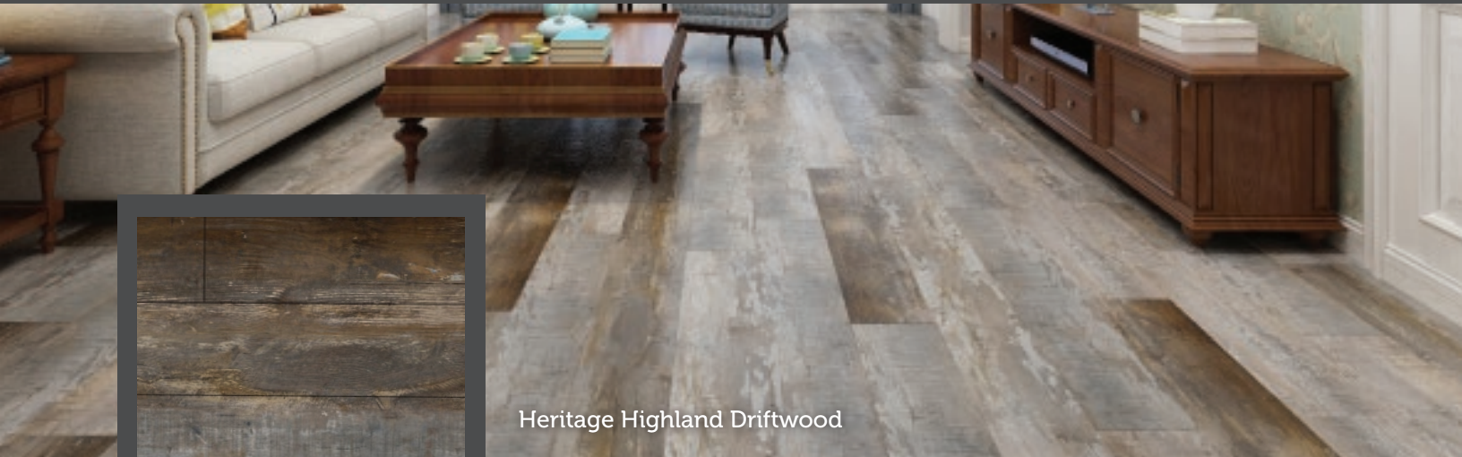
Heritage Highland Driftwood