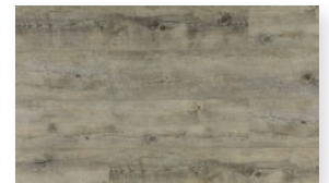
LONG BEACH - SPECIAL ORDER