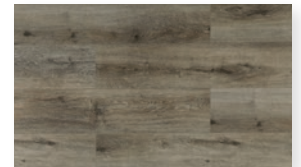
LONG HILL - SPECIAL ORDER