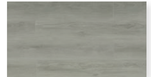
LANGLEY - SPECIAL ORDER