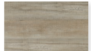
DELANO - SPECIAL ORDER