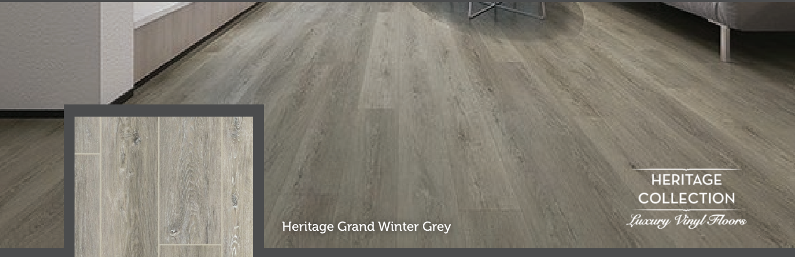
Heritage Grand Winter Grey