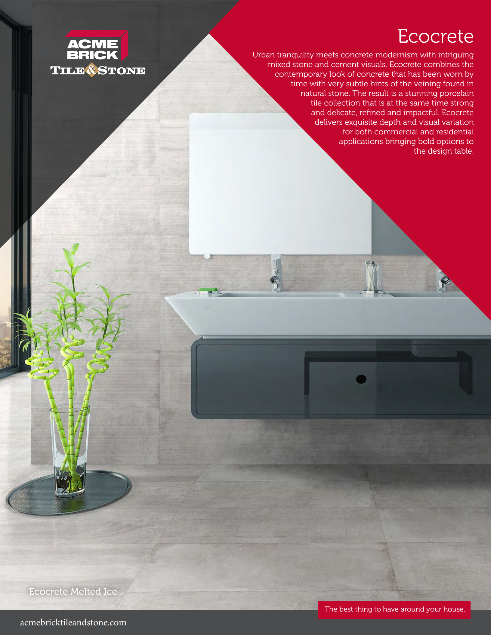
Ecocrete Melted Ice

Urban tranquility meets concrete modernism with intriguing mixed stone and cement visuals. Ecocrete combines the contemporary look of concrete that has been worn by time with very subtle hints of the veining found in natural stone. The result is a stunning porcelain tile collection that is at the same time strong and delicate, refined and impactful. Ecocrete delivers exquisite depth and visual variation for both commercial and residential applications bringing bold options to the design table.