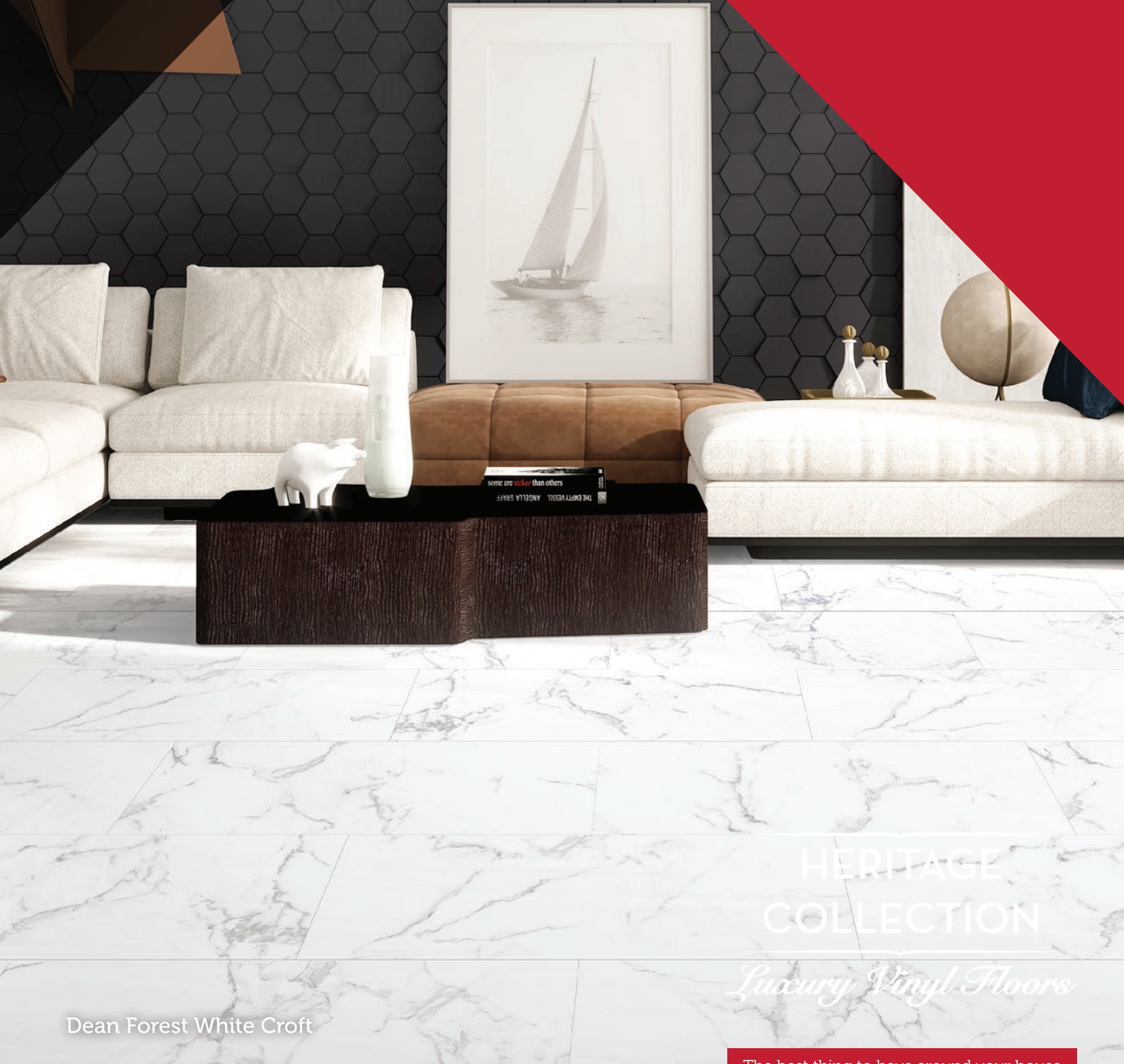
Dean Forest White Croft

Dean Forest provides a myriad of exciting colors, formulated with Eco-friendly materials, Ultra High Definition film and fully embossed wear layer. Dean Forest is ideal for creating the perfect aesthetic within your next interior design project. An attached pad for ease of installation and new SPC waterproof technology, result in the perfect solution to any flooring project.