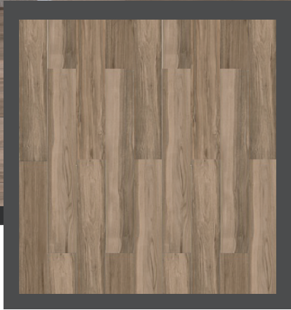
Bryce Wood Brown